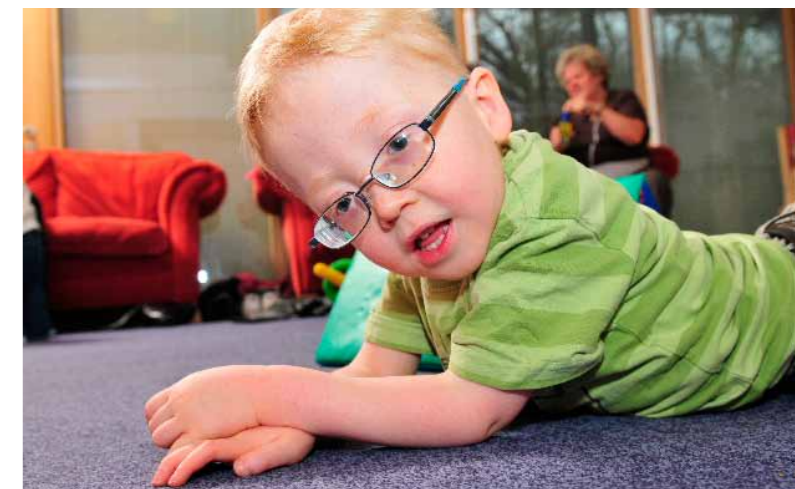
► Our funds have helped us support groups like the White Lodge Centre in Chertsey which provides vital support to children and adults with disabilities

The Lingfield Nature Reserves provide a beautiful wildlife area for local people to enjoy. A £4,898 grant from our Orchid Environmental Trust Fund has enabled the path to be improved so that it can be used by wheelchairs and buggies.